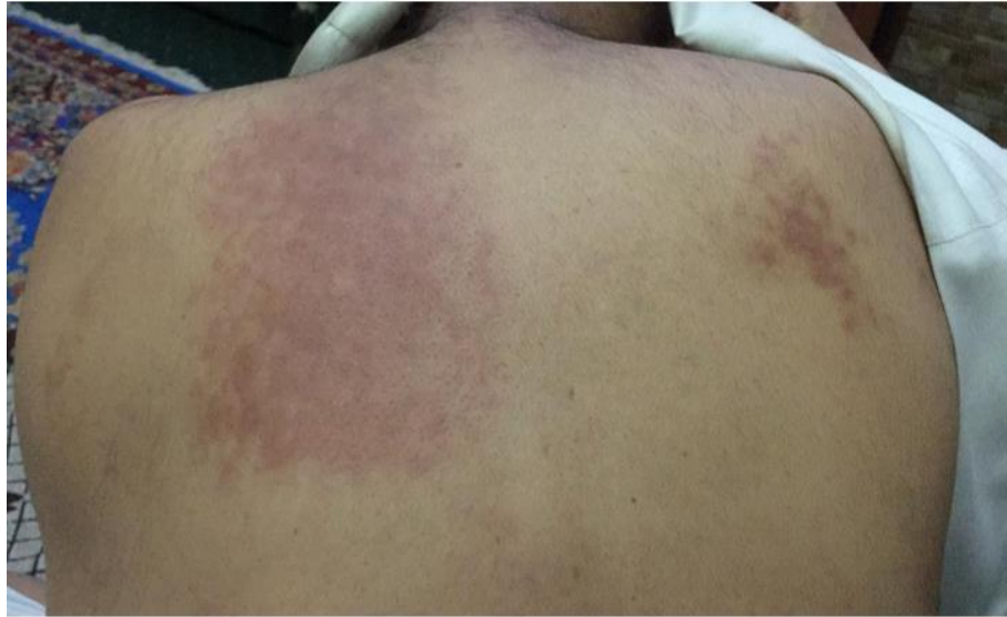
Figure 1: erythematous fleshy plaques, macules, papules in the upper chest