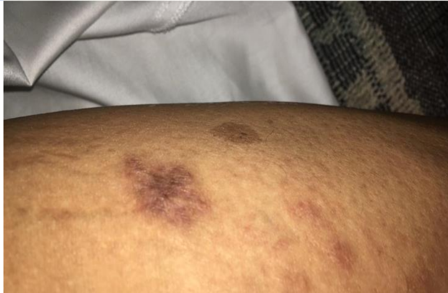
Figure 2: lupus pernio papules and annular