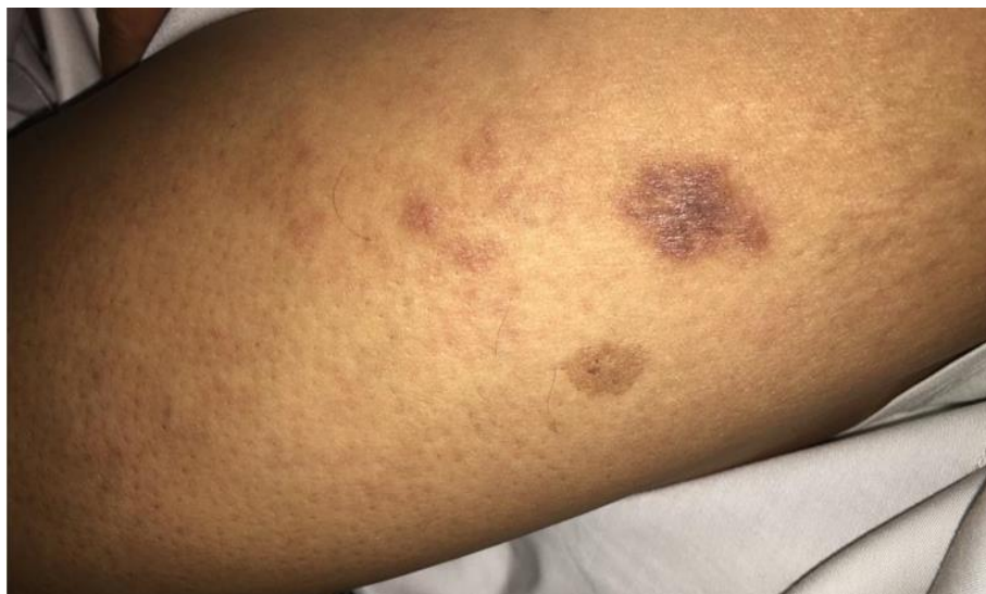
Figure 3 : lupus pernio and plaques and annular lesions